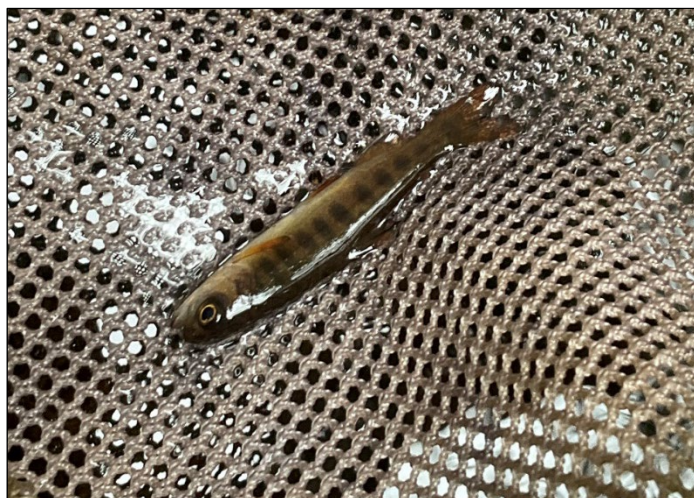
Figure 1.—Juvenile coho salmon captured at waypoint 789.