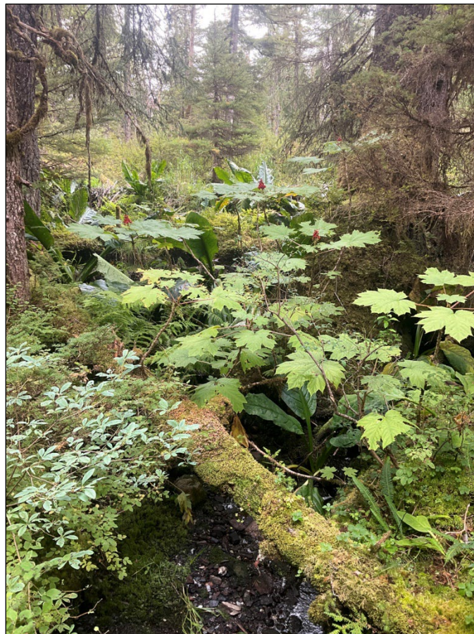
Figure 3.—Tributary 1 at waypoint 789.