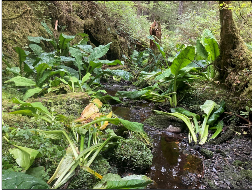
Figure 2.—Tributary 1 at waypoint 798.